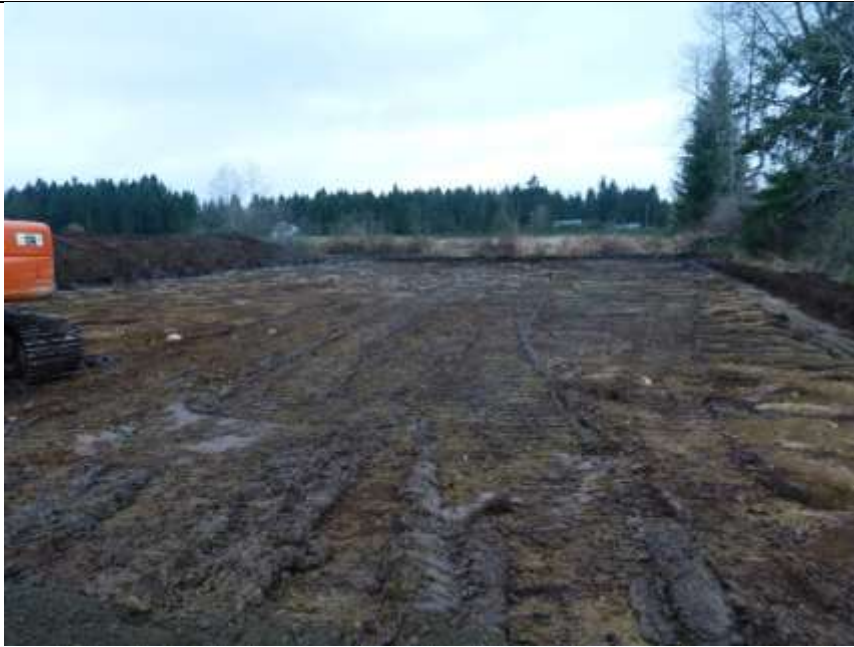
Scraping off topsoil