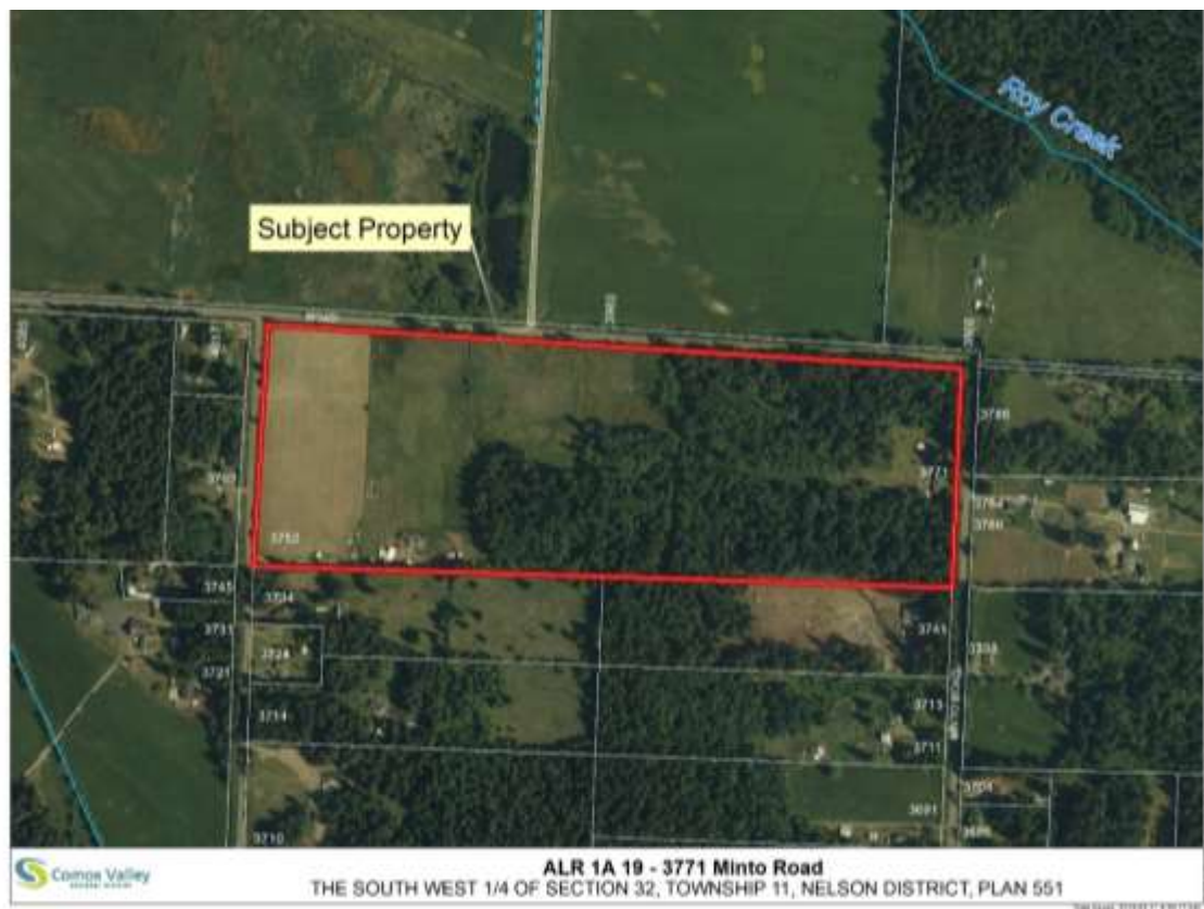
Figure 2: Air Photo (2016)