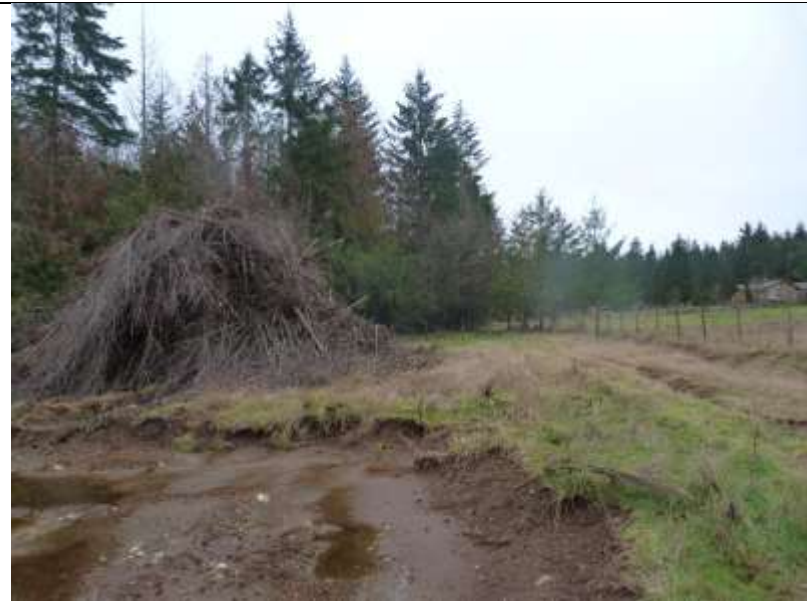
Pile of broom, alder and brush cleared off field