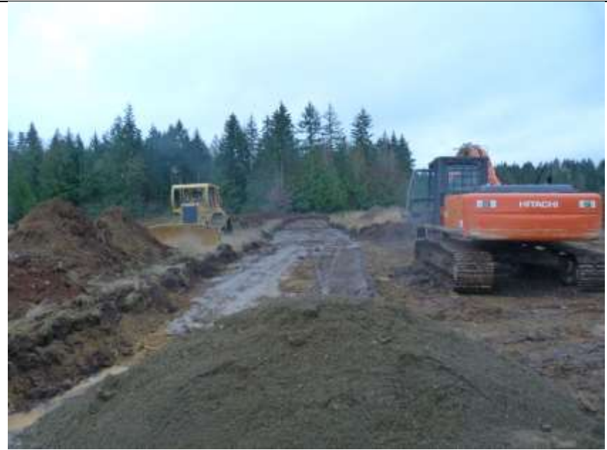
Scraping off topsoil